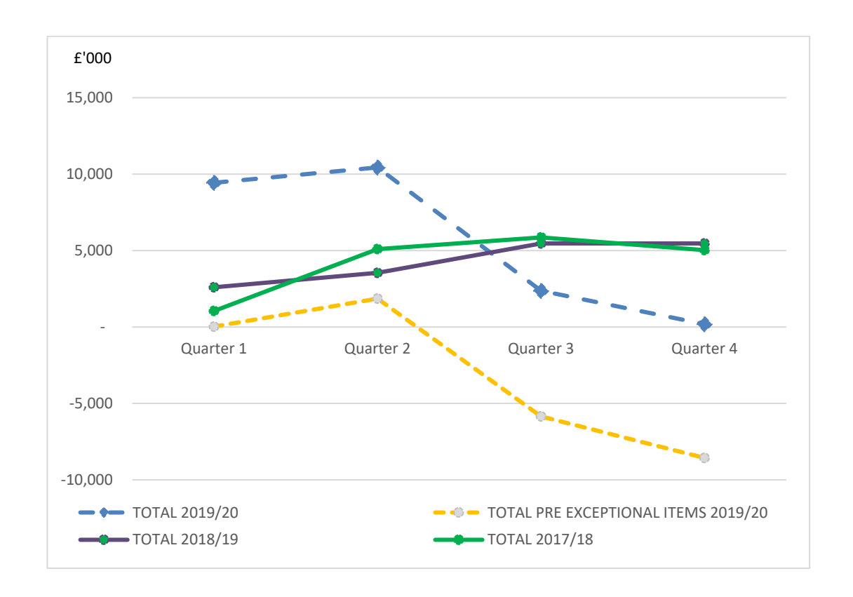
<u>Graph 1 – Forecast Revenue outturn for 2017/18 – 2019/20 by quarter.</u>